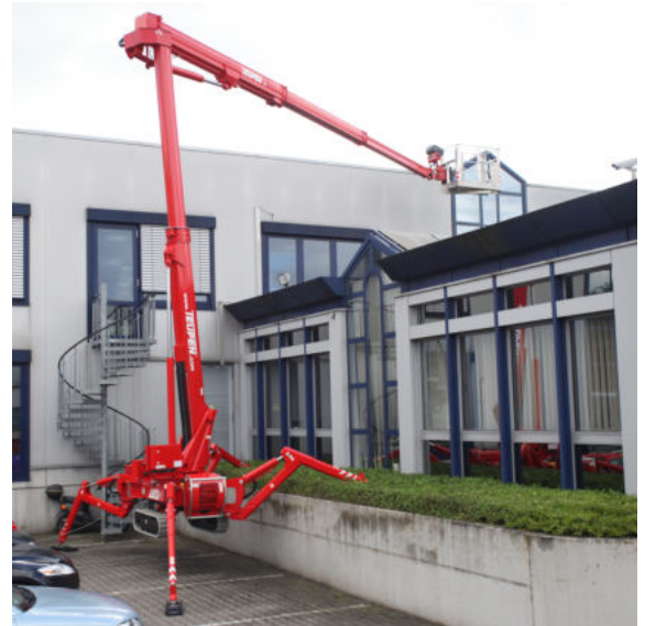
Setting up on ground slopes up to 16,7 ° / 30,0 %