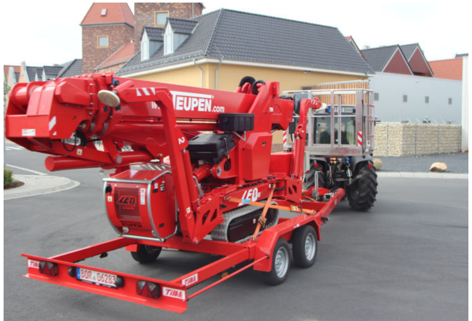
Transportation on standard vehicles (3,5 t)