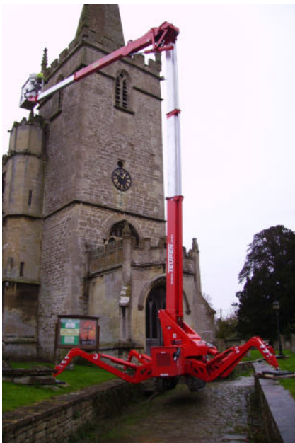
Flexible set up positions