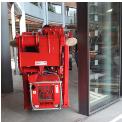
Minimum pass through width of 0,98 m