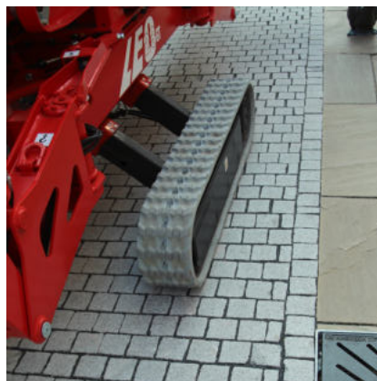
Hydraulically height- and width adjustable crawler tracks